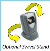
Optional Swivel Stand