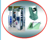
Optional EAS Kit