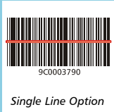
Single Line Option