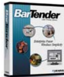
Label Printing Software

Track'em™ Deluxe includes portable scanner, plus Bartender barcode labeling software, providing a seamless label printing solution that's easy to use. Prints barcode labels to any printer.