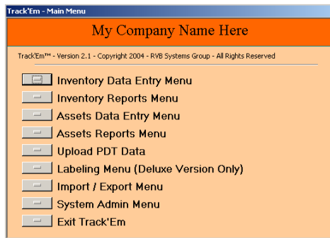
Track'em Main Menu

You can also use Track'em™ to track assets by location and / or any given status (such as person, event, department, etc).